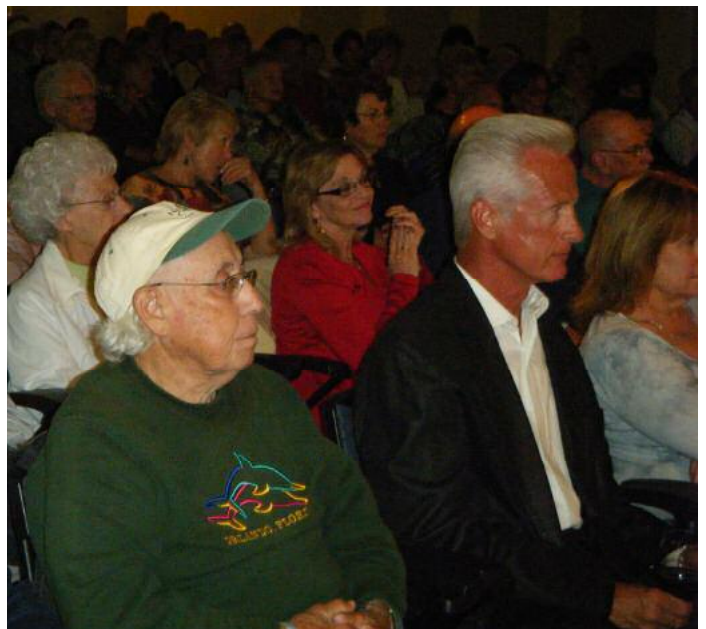
A typical Friday Night Jazz Crowd.